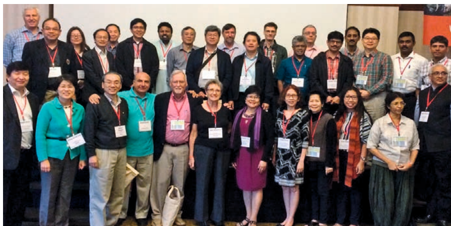
ATA delegates at ICETE Consultation in Antalya, Turkey

W e thank God for giving us the Asia Theological Association (ATA). With an active Board and able staff, ATA continues to grow. We now have 285 members in 34 nations. We are preparing for our upcoming Triennial General Assembly in Seoul, Korea scheduled on July 25-29, 2016. As a theological association, ATA provides various services such as accreditation, leadership training, and publication. With a slogan "training Asians in Asia," ATA oversees Asia Graduate School of Theology (AGST) in various countries through AGST Council. As members of both CHEA International Quality Group (CIQG) and Asia Pacific Quality Network (APQN), we are obligated to ensure that work in accreditation is of quality. With our focus deeply rooted in the Word, ATA continues to grow under God's