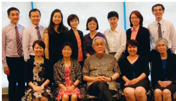
Faculty and staff of API Limited