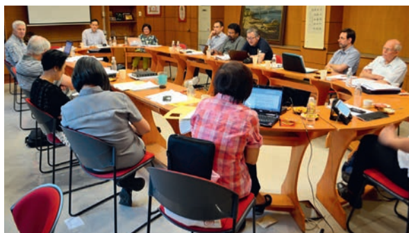
The CAED members listening to reports and updates on accreditation visits

of additional Associate Secretary, when she becomes the new General Secretary