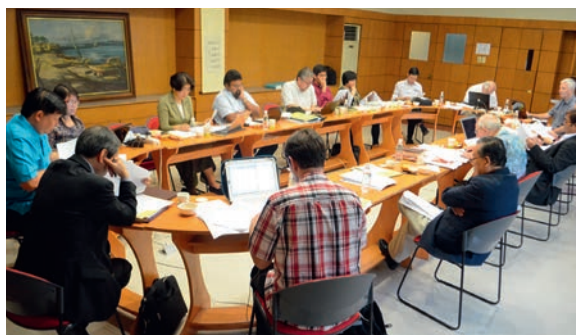
The ATA leaders planning for the 2016 Triennial General Assembly