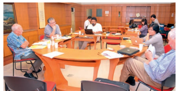
The AGST Council members discussing about important revisions in the handbook and policies