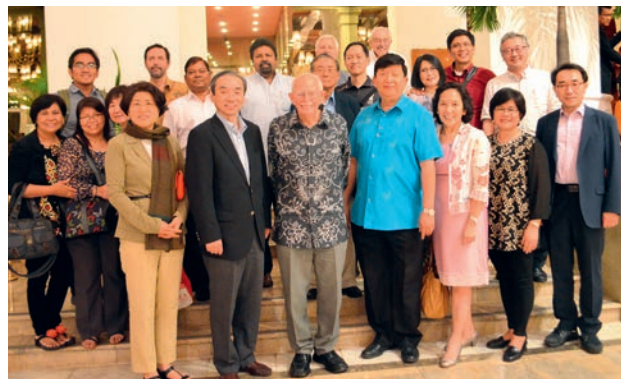
The ATA board and officers with the staff during the dinner treat of the Board Chairman at the Manila Hotel.