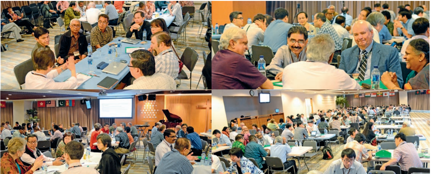
The participants interacting with one another in open discussions