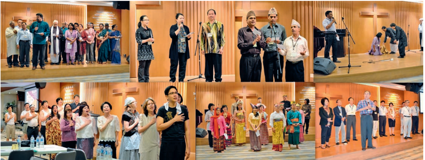
Some participants performing at the Cultural Night