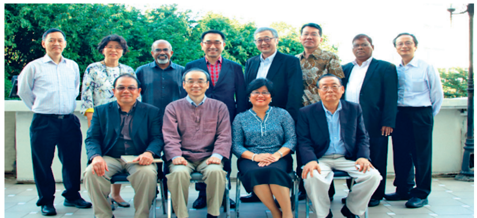
ATA Executive Board

ATA like publication, accreditation, and consultancy are helping member institutions address the issues and challenges that face them for the advancement of God’s kingdom in Asia and beyond.