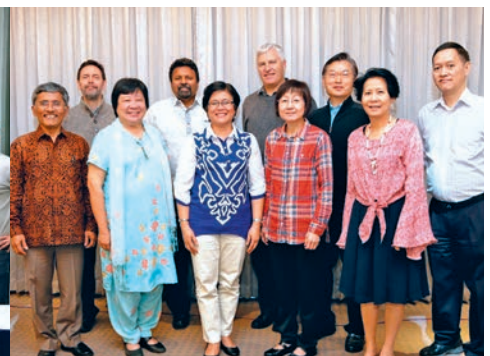
Commission on Accreditation and Educational Development