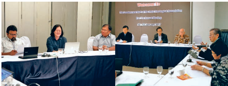
AGST Council meeting

Here are the highlights of the Annual Meetings held on January 10-13, 2017 at Lanna Palace Hotel, Chiang Mai, Thailand: