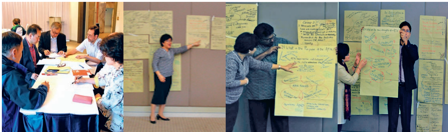
Lively discussions during Strategic Planning