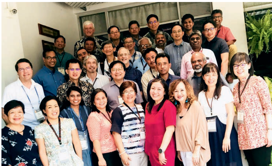
32 participants from different countries and institutions participated in the Field Doctoral Supervisor's Seminar in Chiang Mai, Thailand.

A TA, in partnership with the International Council for Evangelical Theological Education (ICETE) held another seminar to further strengthen doctoral programs in Asia. Last May 9-12, 2018, 32 participants from different