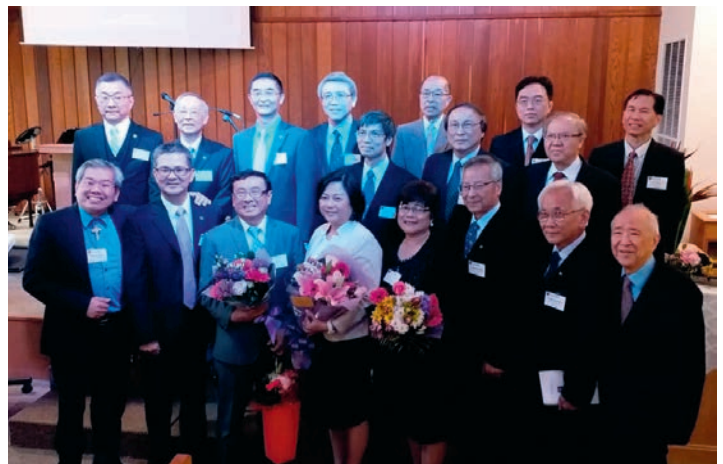
CCST Vancouver's first Commissioning Service.