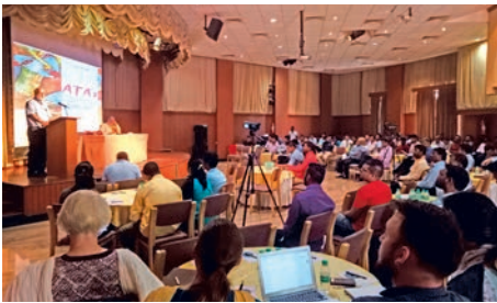
The first Theological consultation organized by ATA India was held last 29 June.