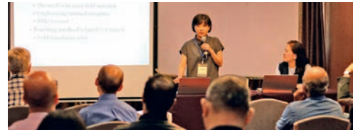
Several papers were presented during the parallel sessions, all modelling how interdisciplinary theologizing has been made possible.