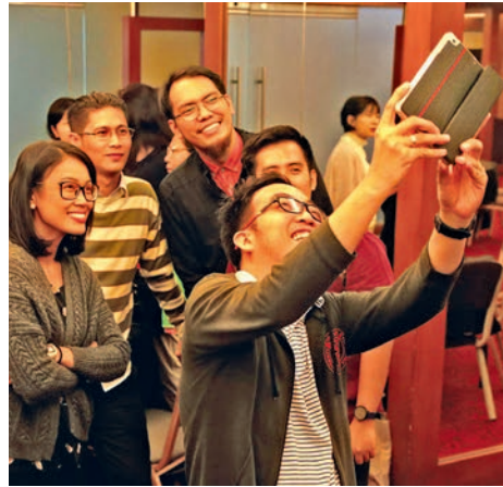
Millennials, the emerging leaders of the church and of seminaries, likewise participated very actively.