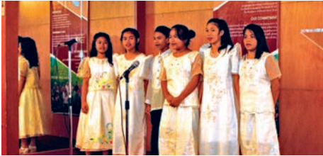
The participants were serenaded by Sparrow Music Philippines