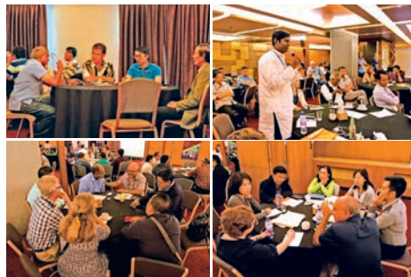
The participants of this year's consultation were very much engaged as they participated in the sessions and group discussions.