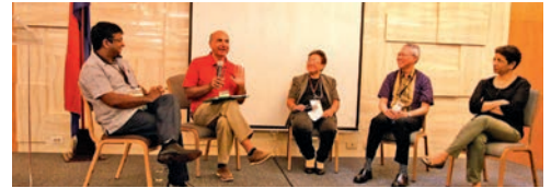
A panel discussion composed of all the plenary speakers along with Dr. Riad Kassir integrated all that had been put forth in the consultation.