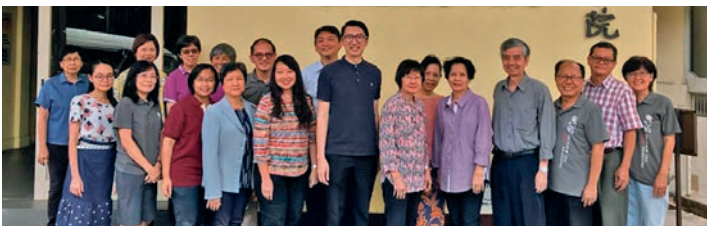
Visit to the Bible College of Malaysia.

God is doing many exciting things in Malaysia, as with the rest of the world—and it's such a joy to see these institutions participate in it. Let's continue to pray that God uses these institutions to equip workers to join God in what He is doing in Asia and beyond!