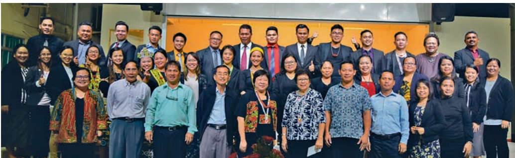
Visit to the Malaysia Evangelical College, Miri Campus.