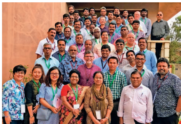
Participants and facilitators for the South India Year 2 GATE Workshop