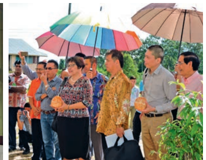
Visit to the Malaysia Evangelical College, Lawas Campus.