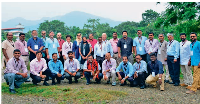
Participants and facilitators for the North India Year 1 GATE Workshop

We are indeed moving forward and expanding in our Equipping the equippers project- and we can definitely look forward to more exciting movements and expansions in the near future!