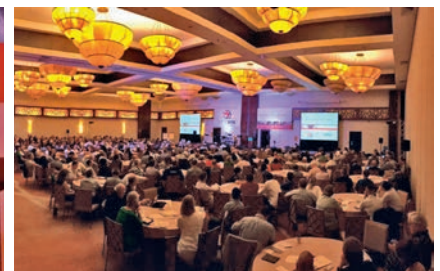
The 2018 ICETE General Assembly was a rich time of collective learning, fellowship and networking.