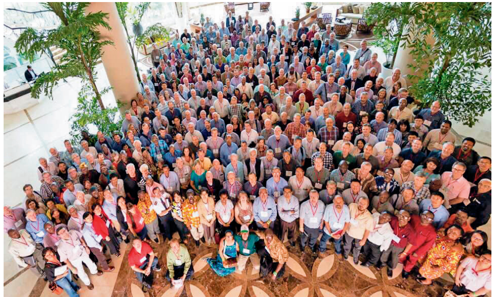
The participants of the 2018 ICETE General Assembly