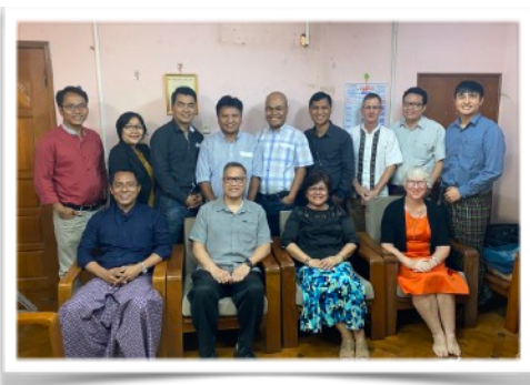
ATA VET at the Myanmar Evangelical School of Theology

During the period of the visit of the team, the Graduation Banquet and