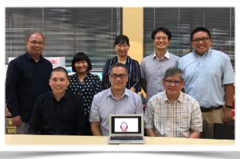
ATA VET at Anglican Training Institute