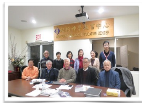
ATA VET at the Chinese Online School of Theology

COST, true to its name, employs purely online media for its courses and programs. More specifically, the institution makes use of Moodle for its course materials, readings, and online discussion forums along with Adobe Connect for lecturer presentations- be it the occasional synchronous live classes and recorded presentations. NYTEC and COST believe that “the world is our campus” and embrace “an educational model that strides across centuries; a learning style that is pertinent to the