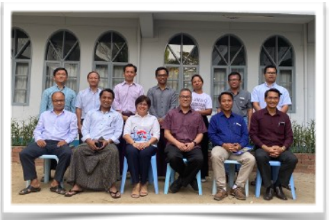
ATA VET at Bethany Theological Seminary