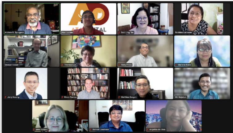
ATA Publications Committee

Editor. He will oversee this new ministry and the team behind it.