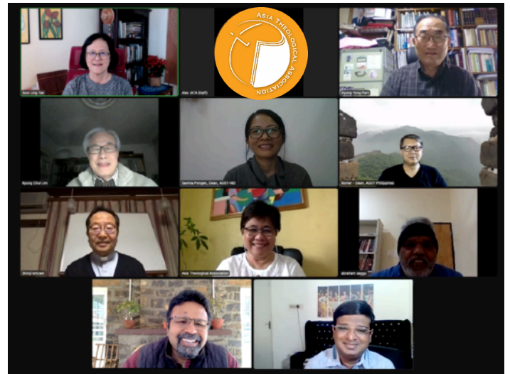
Asia Graduate School of Theology (AGST) Council