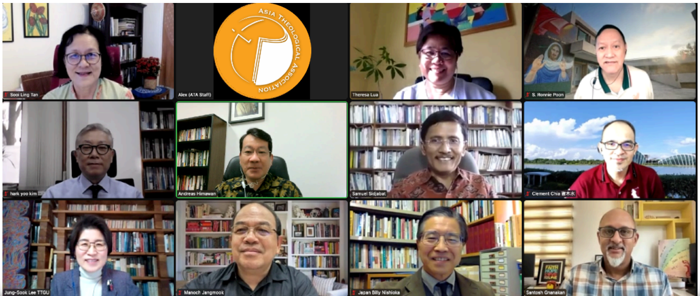
ATA Executive Board