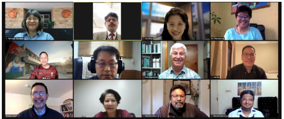
Commission on Accreditation and Educational Development (CAED)

fulfilling their God-given potential. Through this collaboration, we hope to embed Integral Mission Theology more deeply into the training of leaders for the holistic mission of the church. We plan on moving towards this end by equipping faculty in sharpening courses and programs to support the holistic mission of churches. In addition to that, local theological resources will likewise be developed to support the objective.