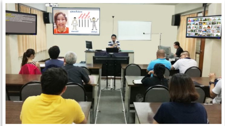
"Limitless Classrooms" in use- enabling more students to enjoy live interaction with one another in a hybrid setting.