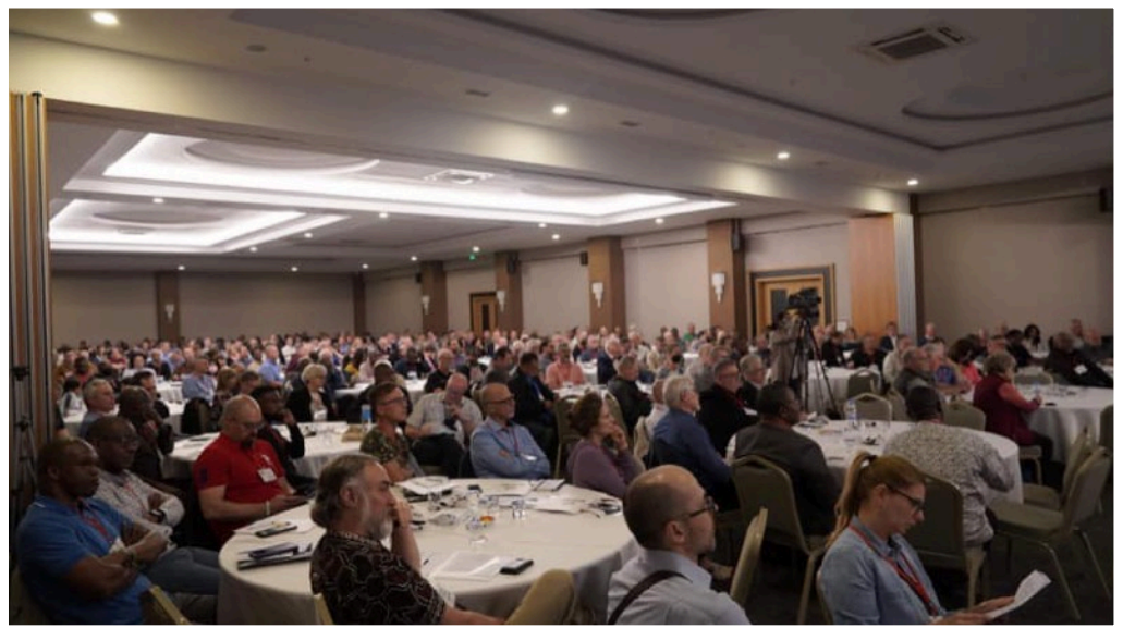
462 delegates from over 80 countries, representing schools, churches, and organizations gathered for the historic C-22