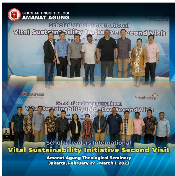
SLI team with the leaders of Amanat Agung Theological Seminary