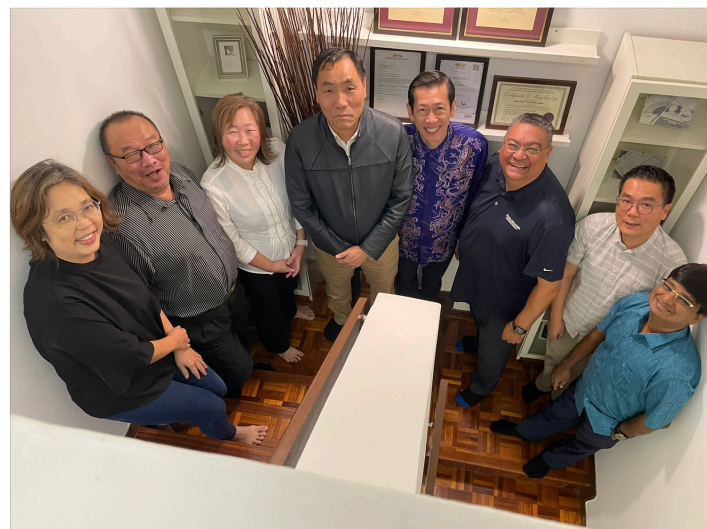
SLI team with the leaders of the Alpha Omega International College

The timing of the VSI consultancy was divine orchestration! Our institution went through a very challenging period and the process had helped us to think deeply about the need for change in the post pandemic era- planned strategies and actions that will engender hope of a compelling future for our stakeholders and constituents. Moving forward, we