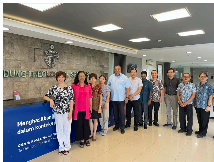
SLI team with the leaders of Bandung Theological Seminary

generate the STTAA strategic plan document for five years (2023–2027), which makes the management of this seminary more focused and direct. I am very appreciative of ATA for recommending our institution for that reason in this regard. Also, I would like to extend my sincere gratitude to the VSI team at SLI for all of the dedicated work they have put into mentoring us throughout the process. The Lord be praised!