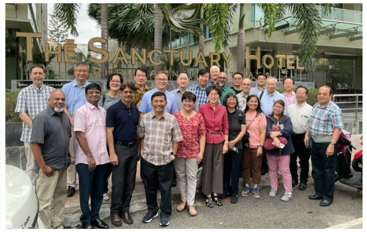
After a little over two years of meeting online, the leaders of ATA gathered in person for the ATA Annual Leaders' meeting.

But apart from these events and gatherings, the ATA annual leaders' meetings (Publications committee, AGST Council, CAED, and the Executive Board) were finally conducted in person- and it was filled with the Lord's favor! The various meetings were held from February 14-17 in Pattaya Thailand and was made possible through a generous Thai Businessman. The leaders of ATA were given free accommodation, meals, and use of conference room at The Sanctuary Hotel. How faithful and how generous the Lord has