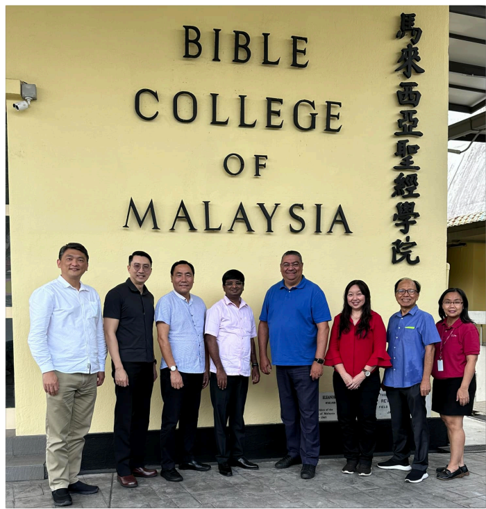
SLI team with the leaders of the Bible College of Malaysia

discussions with the consultants were stimulating and opened our eyes to new ideas and opportunities. The team was very experienced with global insights into issues affecting theological institutions. The team also provided care and support to me as the executive leader.