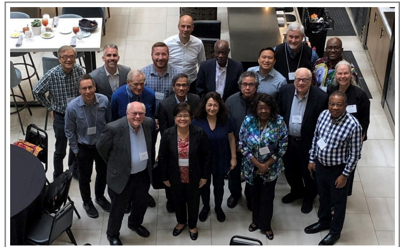
Advisory Board for the Global Formation Project.

On May 8 & 9 the advisory board, composed of leaders from various Christian traditions and global networks, met in Chicago for the purpose of gaining interest, feedback, and support for the forthcoming major project- all of which will be useful contributions to the writing of the full proposal. The two-day meeting