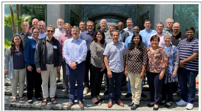
ICETE board, staff, senior advisors and guests.