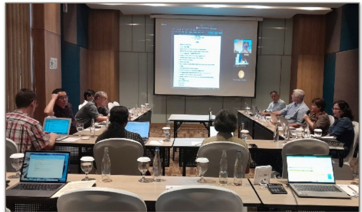
The meeting of the Commission on Accreditation and Educational Development or CAED.