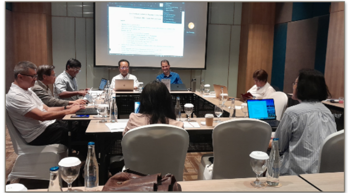
The AGST Council meeting