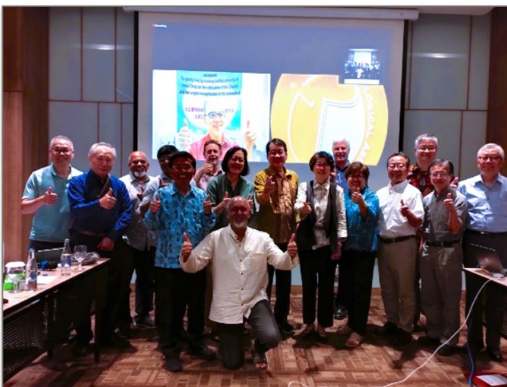
The 2024 Executive Board of ATA.