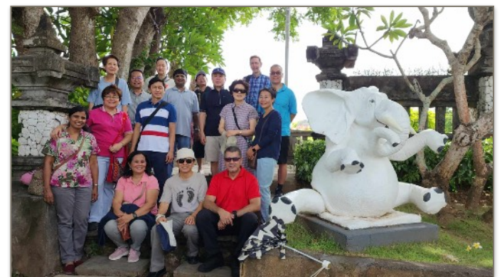
ATA Leaders strengthen their relationship with one another outside work as they tour Bali together.