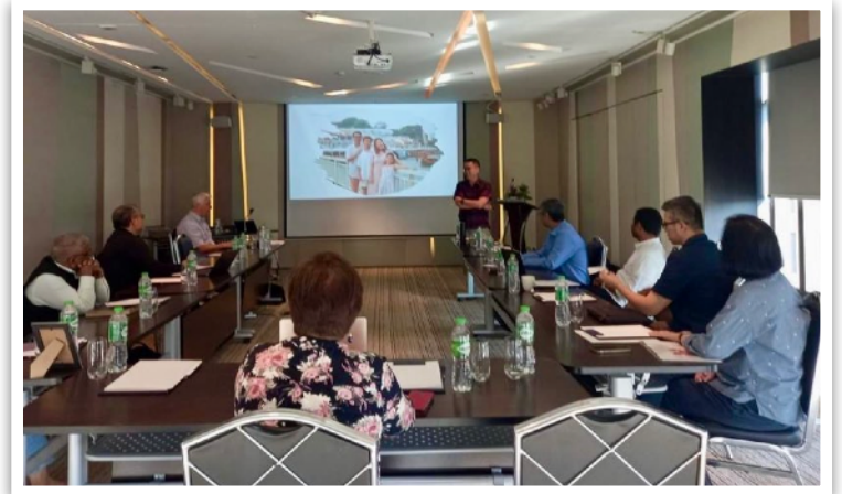
Reflecting and learning together.