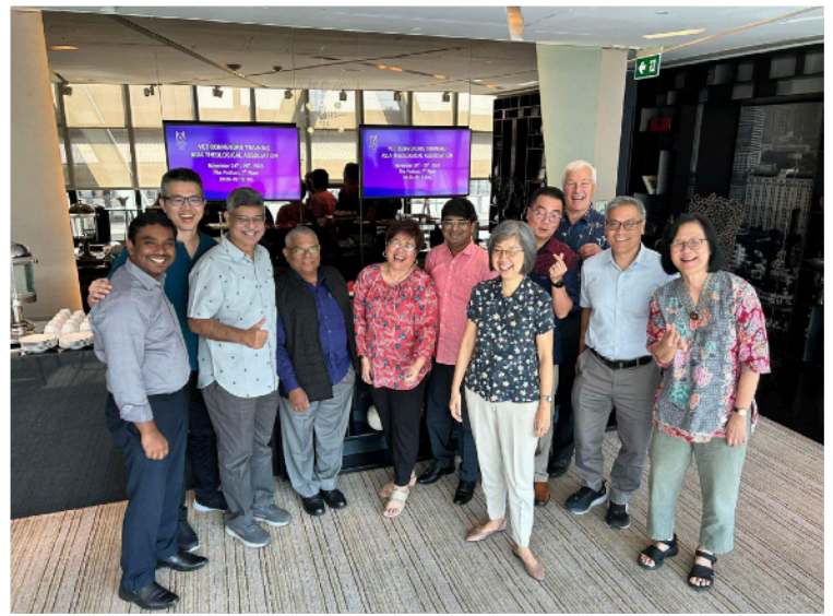
Twelve VET Convenors participated in the Convenors' training held in Bangkok, Thailand. The look on the participants' faces' speak volumes about their time together.

We praise God for the opportunity to conduct this Convenors training and we hope that this will enable to better serve our member institutions through our accreditation services. ◆